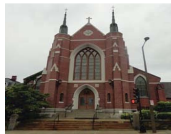
St. Thomas Aquinas Parish

La Parroquia Santa María de los Ángeles es una comunidad Católica multicultural y multilingüe de creyentes en Jesucristo y su mensaje. Nosotros procuramos vivir nuestra fe en alegre adoración, proveyendo alimento espiritual, un ambiente agradable e inclusivo y un sentido de familia en todas nuestras actividades, y comprometidos a promover justicia en nuestra vecindad y el mundo más amplio.