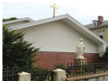
St. Mary of the Angels Parish