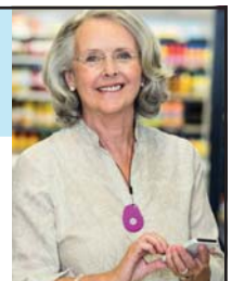
GPS Mobile Above

No Contract • No Fees • Easy Setup • md-medalert.com CALL 800-890-8615