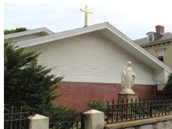
St. Mary of the Angels Parish