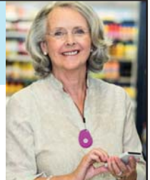
GPS Mobile Above

No Contract • No Fees • Easy Setup • md-medalert.com CALL 800-890-8615