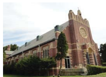
Our Lady of Lourdes Parish