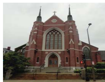
St. Thomas Aquinas Parish

La Parroquia Santa María de los Ángeles es una comunidad Católica multicultural y multilingüe de creyentes en Jesucristo y su mensaje. Nosotros procuramos vivir nuestra fe en alegre adoración, proveyendo alimento espiritual, un ambiente agradable e inclusivo y un sentido de familia en todas nuestras actividades, y comprometidos a promover justicia en nuestra vecindad y el mundo más amplio.