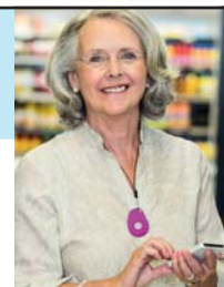
GPS Mobile Above

No Contract • No Fees • Easy Setup • md-medalert.com CALL 800-890-8615