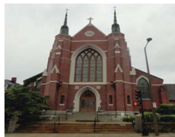
St. Thomas Aquinas Parish

La Parroquia Santa María de los Ángeles es una comunidad Católica multicultural y multilingüe de creyentes en Jesucristo y su mensaje. Nosotros procuramos vivir nuestra fe en alegre adoración, proveyendo alimento espiritual, un ambiente agradable e inclusivo y un sentido de familia en todas nuestras actividades, y comprometidos a promover justicia en nuestra vecindad y el mundo más amplio.