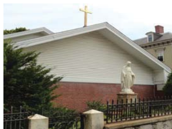
St. Mary of the Angels Parish