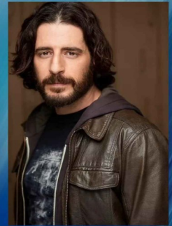
With Jonathan Roumie

91 Guest St. Boston, MA 02135 hopeforlifeboston.com