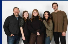
Vigil Project Band